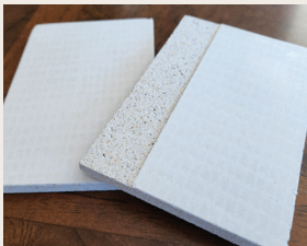
10mm MgSO4 TE 10 board K-CLAD each side for recessed edge for plaster set joints