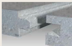
K-FIRE SL19 TG SHAFT LINER 2700 x 600