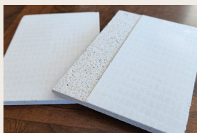
10mm MgSO 4 TE 10 board K-CLAD each side for recessed edge for plaster set joints

NO ADDITIONAL 16mm Fyrchek plate between floors