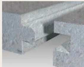
K-FIRE SL19 TG SHAFT LINER 2700 x 600